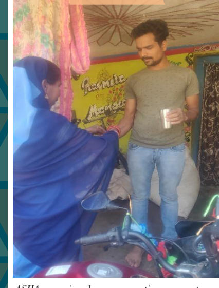
ASHAs ensuring drug consumption amongst family members in the rural households during the MDA