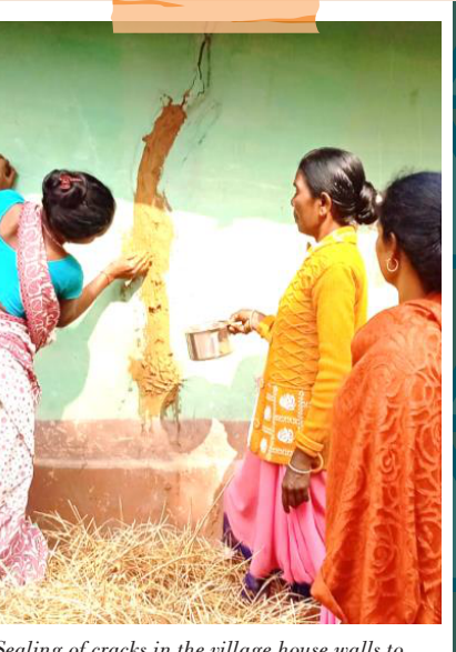
Sealing of cracks in the village house walls to prevent sandfly breeding for the prevention of Kala Azar transmission