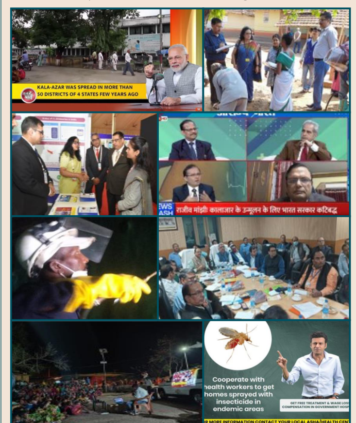
Director's Office National Centre for Vector Borne Disease Control M/o Health & Family Welfare, Govt. of India 22-Sham Nath Marg, Delhi-110054 Contact: 23921086